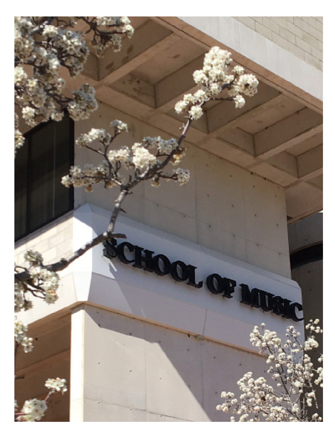
Llewellyn Hall Sustainability Plan V1.0 June 2022